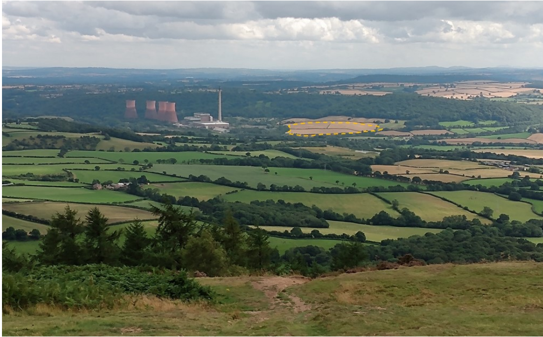
View from the Wrekin summit with greenfield land shown in the masterplan for housing development shown in dashed yellow line.

While it is clear that development is not proposed to extend to the furthest boundaries of the ownership, the greenfield area indicated on the masterplan for housing is still extensive. At its north-west corner it comes right up to the AONB boundary and to about 200m from the important heritage asset of Buildwas Abbey. The land slopes to the north, and the uphill southern two fields are visually prominent (as shown above) in views from The Wrekin summit, one of the most visited countryside locations in the AONB and the county. The western part of these fields includes land which starts to slope to the west away from the power station site, so development here would not link visually with main part of the site and would have the impression of spilling over into the valley leading south to Farley occupied by the A4169.